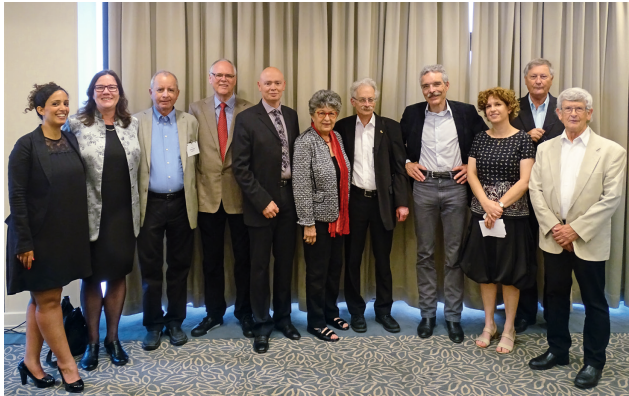
Joint Scientific Program Committee and Coordinators

The 40 th anniversary of the Cooperation was celebrated with a scientific symposium in March 2016 in Tel Aviv. Ofir Akunis, Minister of Science and Technology, opened the symposium highlighting the scientific and intercultural achievements of the German-Israeli Cooperation.